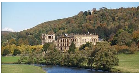
Chatsworth House with The Hunting Tower above